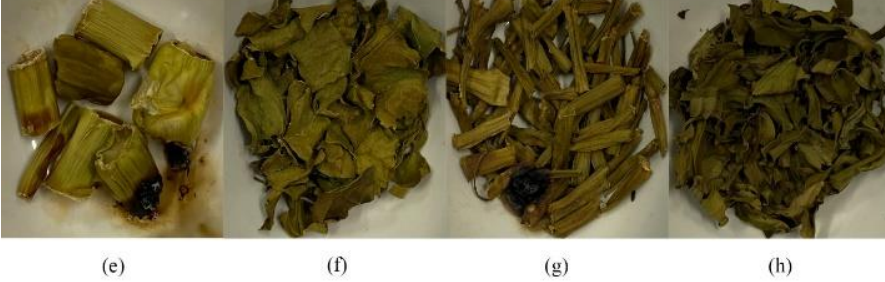
Fig. 5. Physical appearance of organic wastes after microwave assisted 800W for 5 min and drying at 105 °C for 1: (a) cabbage; (b) radish; (c) napa cabbage (stalk); (d) napa cabbage (leaf); (e) kale (stalk); (f) kale (leaf); (g) morning glory (stalk); (h) morning glory (leaf).