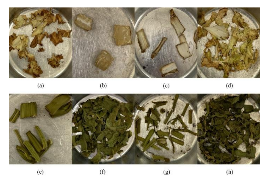
Fig. 4. Physical appearance of organic wastes after drying at 105 °C for 1 h: (a) cabbage; (b) radish; (c) napa cabbage (stalk); (d) napa cabbage (leaf); (e) kale (stalk); (f) kale (leaf); (g) morning glory (stalk); (h) morning glory (leaf).